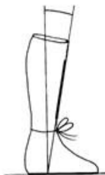
SHANK ANGLE TO FLOOR OF AFOFC IN DEGREES FROM THE VERTICAL